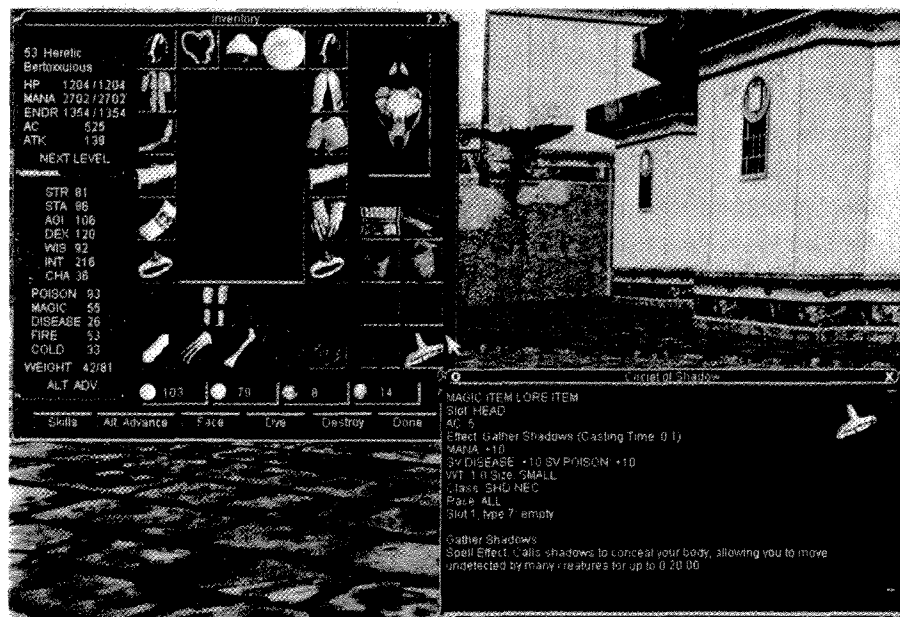
Figure 3.1 Inventory screen and breakdown of statistics for specific items

power gamer from the more casual one who may move onto a different location after several unsuccessful attempts.